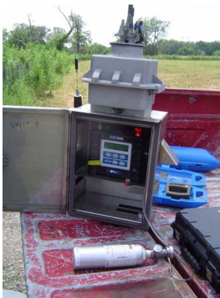
Figure 5. AreaRAE lowered for calibration.