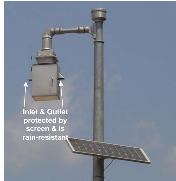
Figure 2. Close-up view of AreaRAE cabinet and solar panel.

by screens to prevent insects and particles from entering (Figure 2).